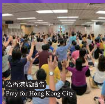
為香港禱告 Pray for Hong Kong City

沒有新一代就沒有未來；培育新一代是所有教會重點事工。錦光教會一直以來用敬虔、卓越等特質來打造年青人，眼見許多年青人在愛主和學業成績上不住突破進步，今年不少大學生以一級榮譽或Dean's List成績畢業，在主恩佑中進入職場，找到夢想方向，我為他們感恩。求父神使用你們，繼往開來，使神國不住向前拓展，領萬民作基督門徒，榮耀全歸三一真神。阿們！